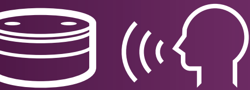
< Voice-controlled smart speakers will be used as interview devices