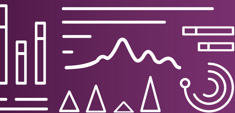
^ Sleek and smart dashboards will provide perscriptive analytics